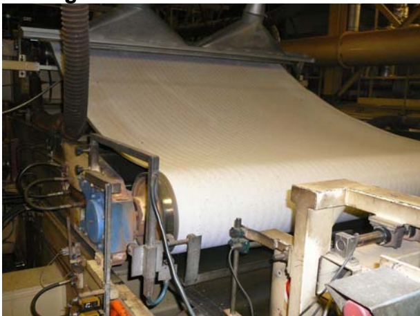
Belt, pre press