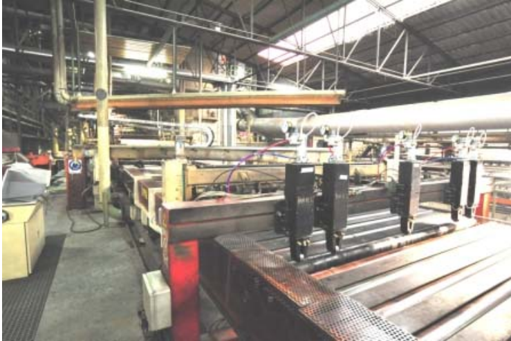
Thickness measuring unit