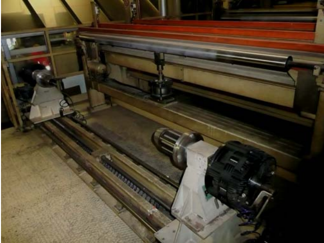
Paper feeding device