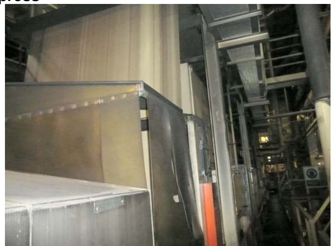
Top belt for RF-plant