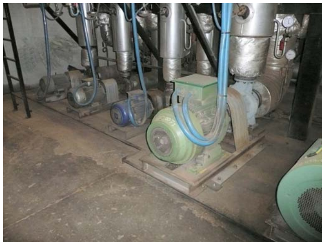
Thermo oil pumps