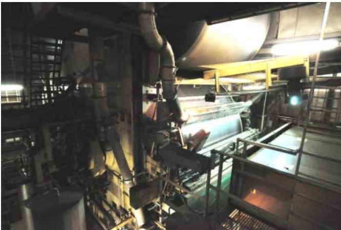
Calender press Auma 50