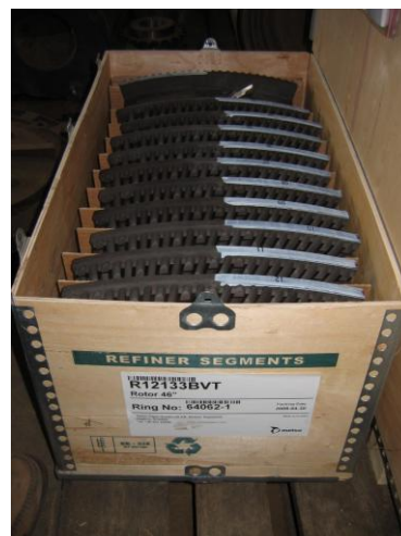
150-47 refiner segments rotor