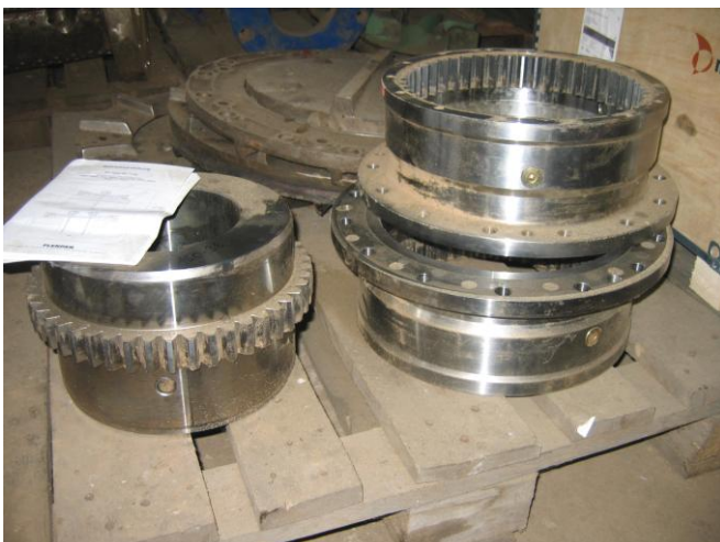
150-38 zapex coupling