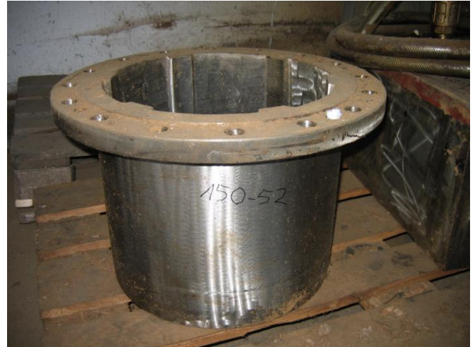
150-52 wearing sleeve