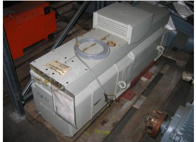
151-81 motor Siemens 30 kW