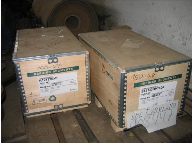
150-48 refiner segments stator