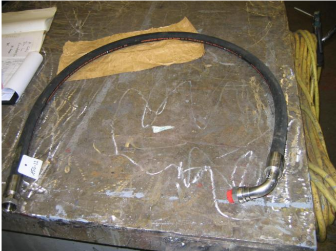
150-22 high pressure hose