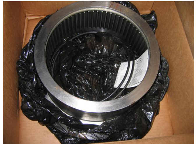
50-96 bushing main shaft