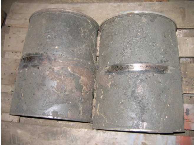
150-73 wearing sleeve