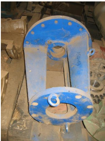
150-63 support for plug