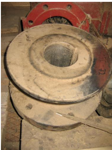
150-72 coupling for agitator