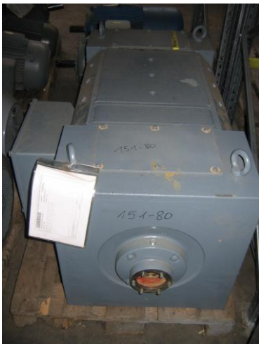
151-80 Siemens motor 338 kW