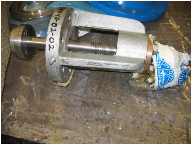
150-89 bottom valve