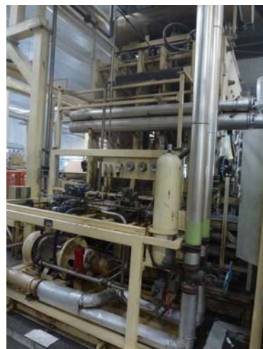
Hydraulic press / hydraulic unit