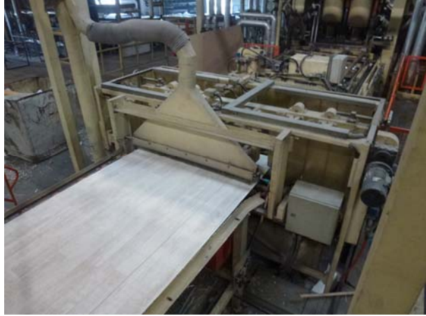
Edge cleaning device