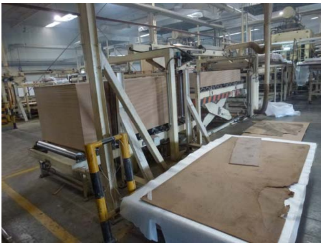
Stack roller conveyor / lifting table / pushing device

Press system : downstroke Major suppliers : SWPM Number of openings : 1 pcs Board length max. : 2745 mm Board width max. : 1260 mm Year of manufacture : 2007