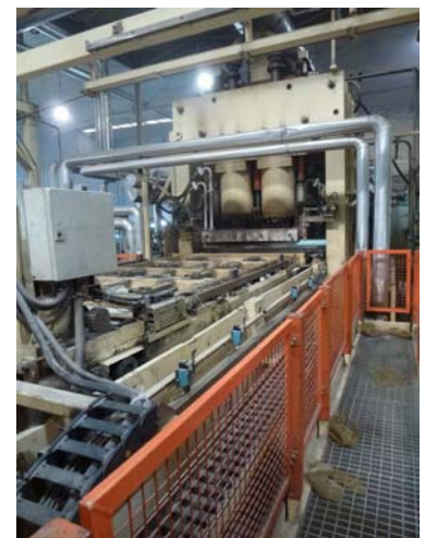
Press vacuum out-feed Device