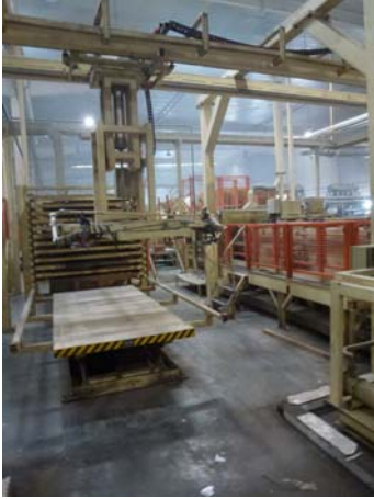
Coul plate storage / coul plate