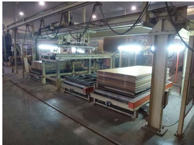
Board stacking device