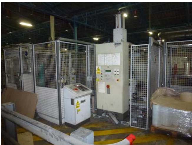
Belt stripping device