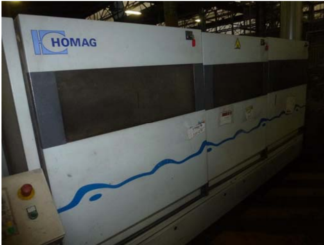
Transversal double end profiler