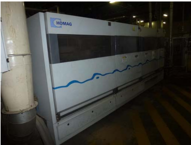
Longitudinal double end profiler