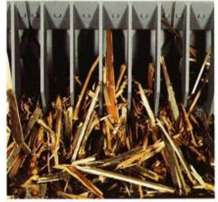
Picture 2: Lateral discharge of crushed material, therefore no expensive foundation required