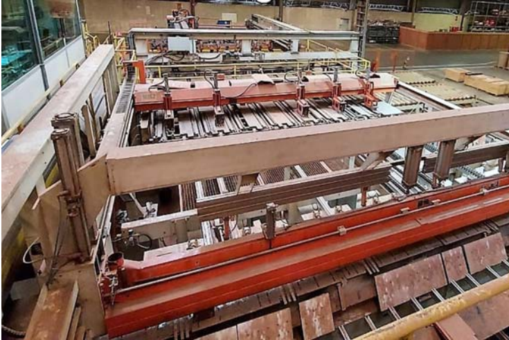
Cut to size