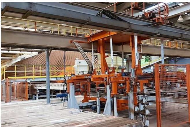
Cooling / Stacking