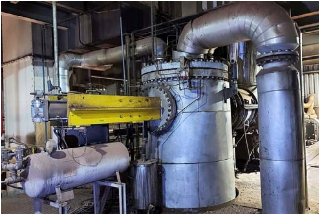
Plug screw / BBV / Digester