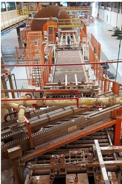
Saw and cooling