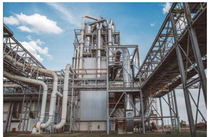
Sifter / Forming Cyclons